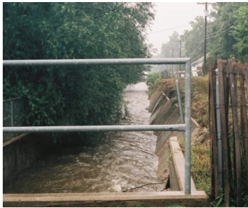
stormwater wall collapse

Over time, stormwater structures such as pipes and catch basins can become clogged and/or damaged, impairing their ability to carry stormwater runoff. If these stormwater structures are not maintained, stormwater runoff may build up in Ottawa pipes, overflowing into streets and inundating existing drainage systems.